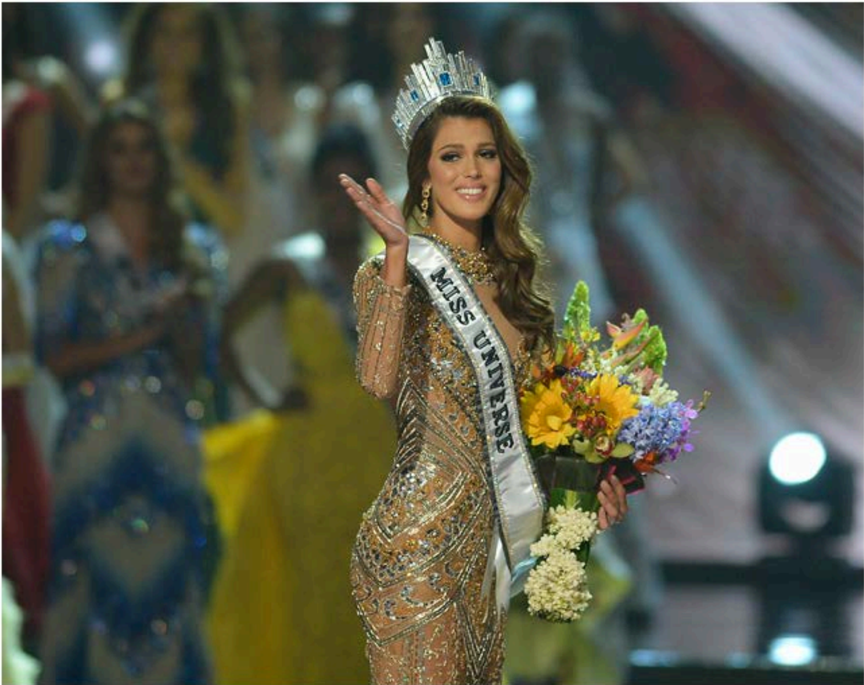
Miss Universe candidate Iris Mittenaere of France waves to the audience after winning the title in the Miss Universe pageant at the Mall of Asia Arena in Manila.

Former Miss Universe Pia Wurtzbach poses as she arrives at the Miss Universe after-party red carpet event at a hotel in Manila. Miss France was crowned Miss Universe on January 30 in a glitzy spectacle free of last year's dramatic mix-up but with a dash of political controversy as finalists touched on migration and other hot-button global issues.