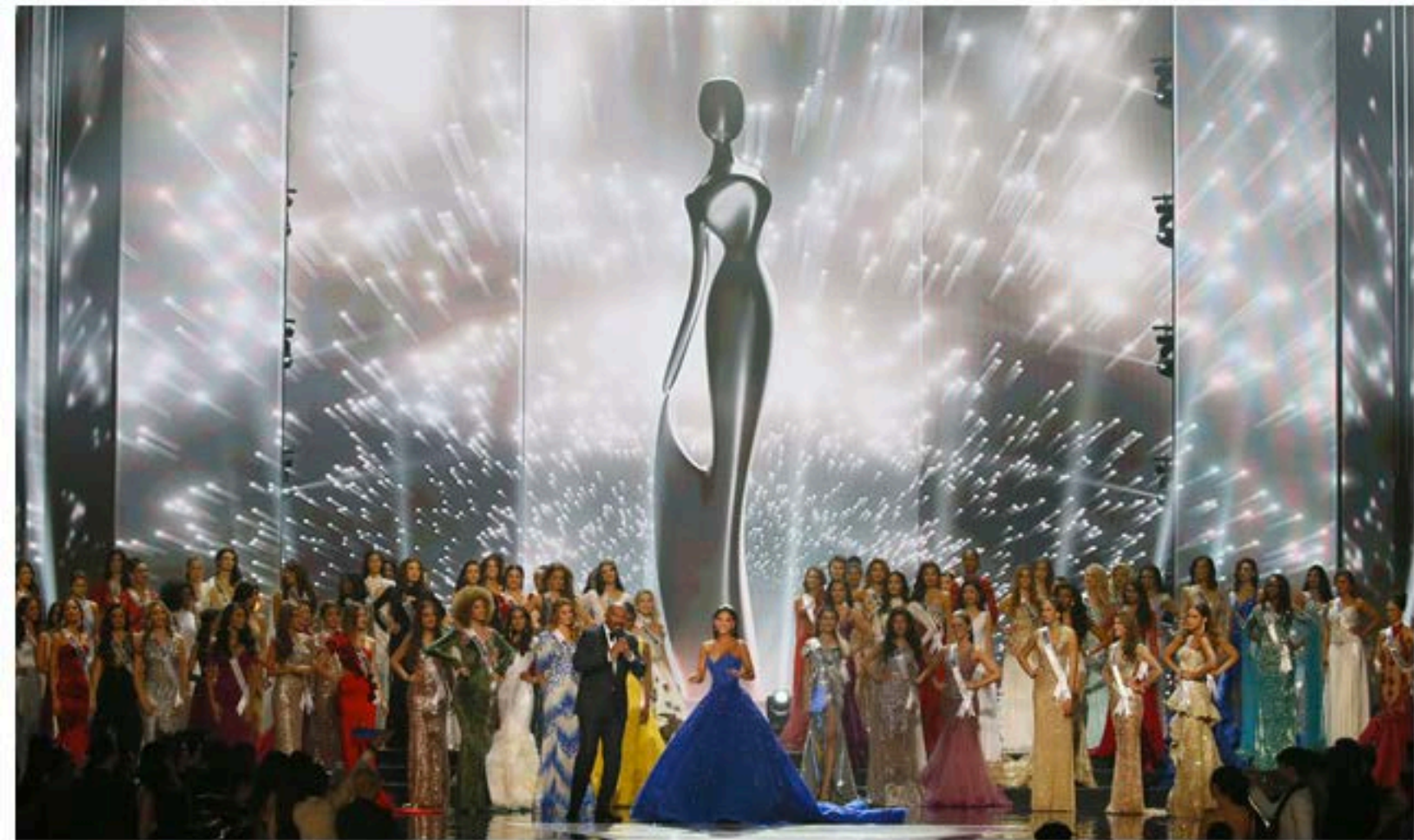
Miss Universe 2015 Pia Wurtzbach, center, bids farewell after ending her reign as the country's third Miss Universe winner during the grand coronation for the new Miss Universe.