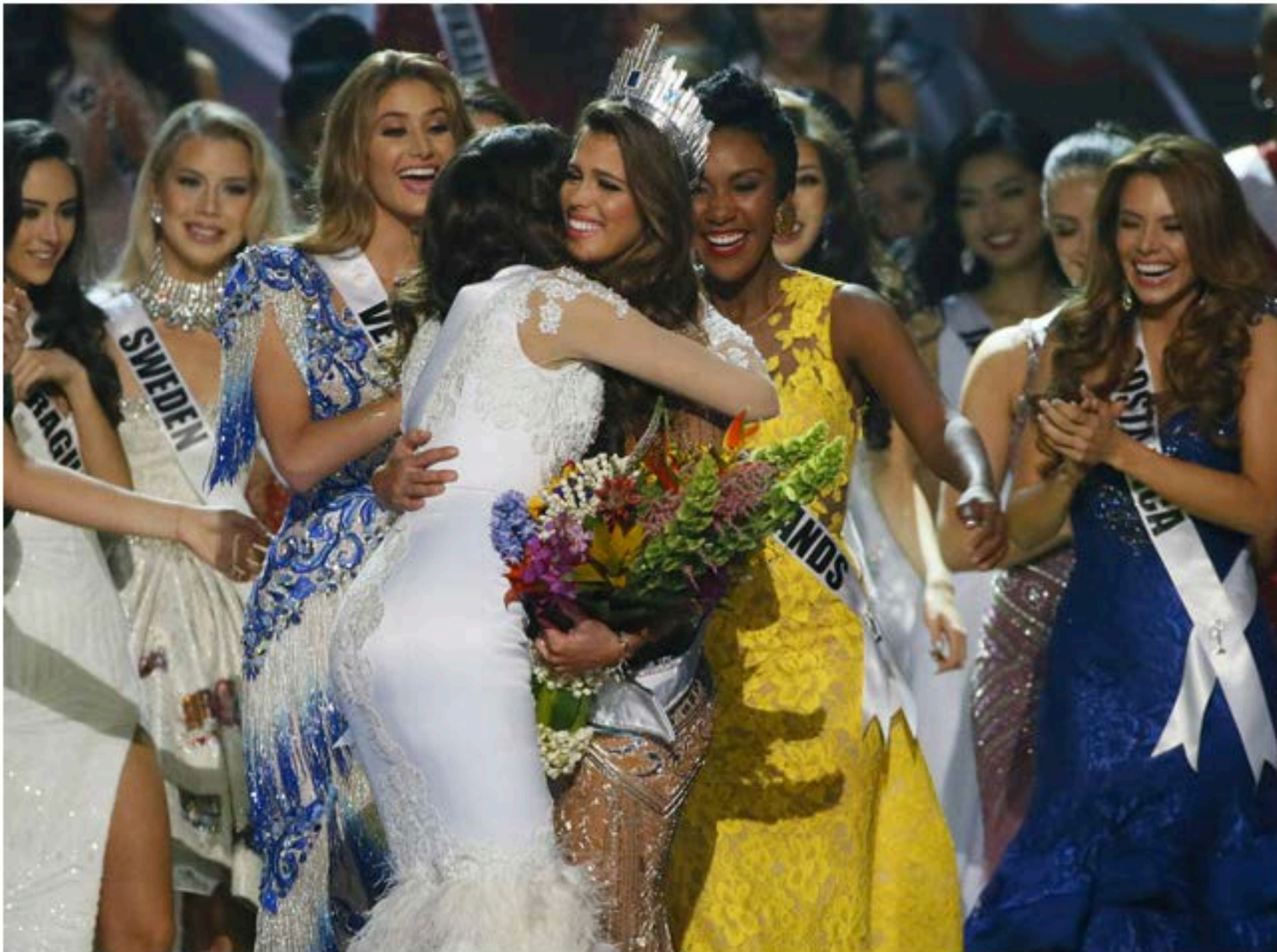
Iris Mittenaere, center right, of France is congratulated by fellow contestants shortly after being proclaimed the Miss Universe 2016 in coronation.